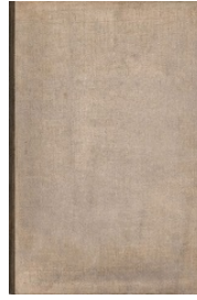
The walking stick.