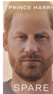
Spare / Prince Harry. Harry, Prince, Duke of Sussex, 1984- author.