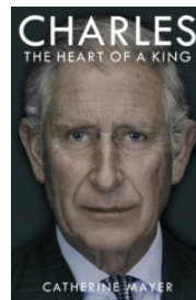
Charles : the heart of a king / Catherine Mayer. Mayer, Catherine, author.