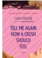
Tell me again how a crush should feel Sara Farizan.