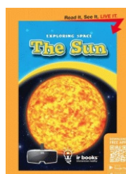
The sun/ by Colleen Sexton. Sexton, Colleen, author.