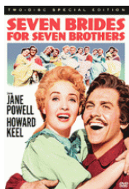
Seven brides for seven brothers (DVD)