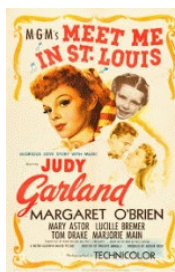
Meet me in St. Louis

a Metro-Goldwyn-Mayer picture ; produced by Arthur Freed ; screenplay by Irving Brecher and Fred F. Finklehoffe ; directed by Vincente Minnelli.