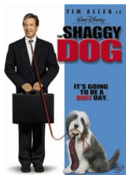
The shaggy dog (DVD)

a Metro-Goldwyn-Mayer picture ; produced by Arthur Freed ; screenplay by Irving Brecher and Fred F. Finklehoffe ; directed by Vincente Minnelli.